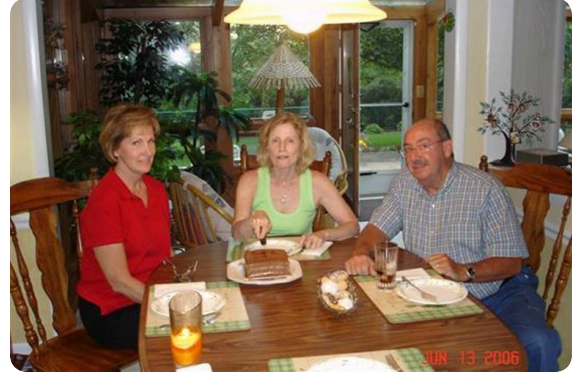
Our home in Palatine in '06